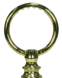
90-1775 5 Notch Hang Straight Brass Finish