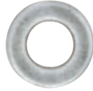
Steel Washer 1/4 IP Slip - 16 Gauge Unfinished