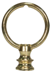
90-1776 1 Notch Hang Straight Brass Finish