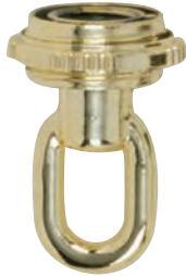
90-2342 Brass Finish