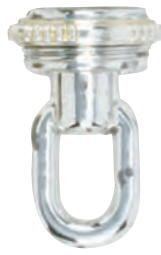
90-337 Chrome Finish