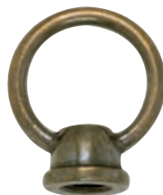
90-254 Ant. Brass Finish