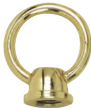
90-249 Brass Finish