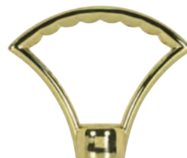
Hang Straight Loop 90-1728 Pol. Brass Finish 90-1729 Ant. Brass Finish 90-1730 Pol. Chrome Finish