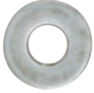
Steel Washer 1/8 IP Slip - 16 Gauge Unfinished