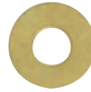
Light Steel Washer 1/8 IP Slip Brass Plated