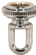
90-2302 Polished Chrome