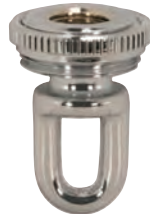
90-2300 Polished Chrome