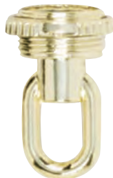
90-1164 Brass Finish