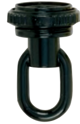
90-2421 Black Finish