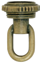
90-336 Ant. Brass Finish