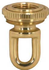
90-2297 Polished & Lacquered