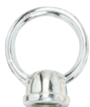
90-599 Chrome Finish