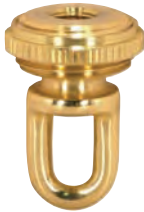
90-2295 Polished & Lacquered