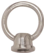
90-2515 Brushed Nickel Finish