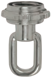
90-2494 Brushed Nickel Finish