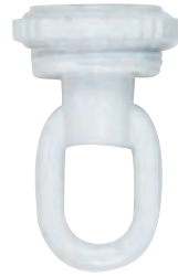
90-2422 White Finish