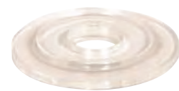
Plastic Crystal Washer 1 1/4" Dia. w/Lip - 1/8 IP Slip