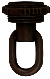
90-2495 Old Bronze Finish