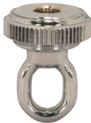
90-2303 Polished Chrome