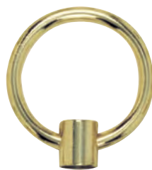
90-263 Brass Finish 90-1726 Ant. Brass Finish 90-1727 Pol. Chrome Finish