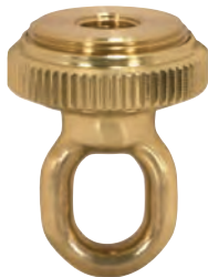
90-2299 Polished & Lacquered