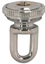
90-2301 Polished Chrome