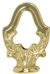
90-253 Brass Finish 90-340 Ant. Brass Finish 90-341 Chrome Finish