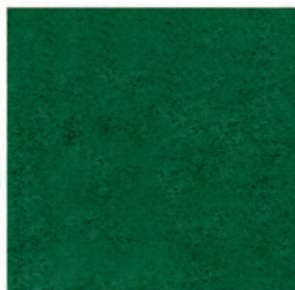
90-489 Green Felt - 36" Wide Sold by the Yard

More Colors Available - Call for Information