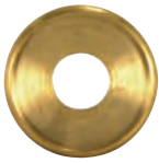
Turned Brass Check Ring 1/8 IP Slip – Unfinished