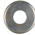
Steel Check Ring Curled Edge 1/8 IP Slip - Unfinished

90-1661 1/2" 90-1710 1 1/8" 90-2051 5/8" 90-1095 1 1/4" 90-381 3/4" 90-1096 1 1/2" 90-383 7/8" 90-1644 1 3/4" 90-361 1" 90-1790 2"