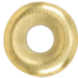
Beaded Steel Check Ring 1/8 IP Slip

90-2050 1/2" 90-2059 1 1/4" 90-2052 5/8" 90-2062 1 3/8" 90-2053 3/4" 90-2063 1 1/2" 90-2055 7/8" 90-2074 1 3/4" 90-2056 1" 90-2076 2" 90-2058 1 1/8"