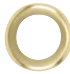
Steel Check Ring Curled Edge 1/4 IP Slip - Brass Plated

90-358 3/4" 90-2075 1 3/4" 90-472 1" 90-1656 2" 90-473 1 1/4" 90-2091 1 1/2"