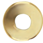
Steel Check Ring Curled Edge 1/8 IP Slip - Vacuum Brass

90-388 1 1/8" Brass Plated 90-389 1 1/8" Nickel Plated