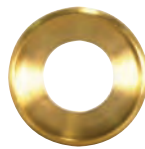
Turned Brass Check Ring 1/4 IP Slip – Unfinished