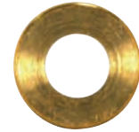
Turned Brass Check Ring 1/4 IP Slip Burnished and Lacquered