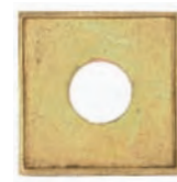
1/8 IP Slip