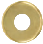
Turned Brass Check Ring 1/8 IP Slip Burnished and Lacquered