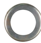
Steel Check Ring Curled Edge 1/4 IP Slip - Unfinished

90-358 3/4" 90-2075 1 3/4" 90-472 1" 90-1656 2" 90-473 1 1/4" 90-2091 1 1/2"