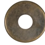
Steel Check Ring Curled Edge 1/8 IP Slip - Antique Brass

90-1788 5/8" 90-1766 1" 90-1765 3/4" 90-2182 1 1/4" 90-1789 7/8" 90-1763 1 1/2"