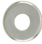
Turned Brass Check Ring 1/8 IP Slip Nickel Plated