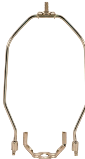
Polished Nickel Finish 125 CTN