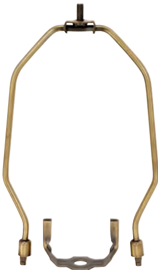
Antique Brass Finish 125 CTN