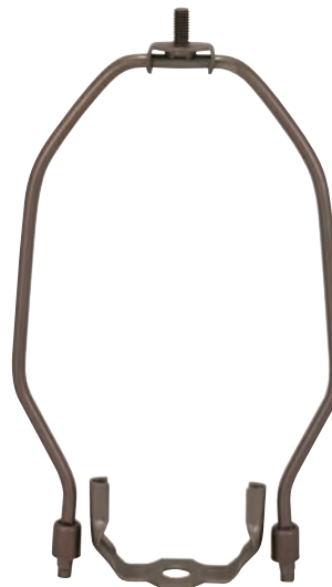
Dark Antique Brass Finish 125 CTN