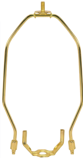
Polished Brass Finish 125 CTN